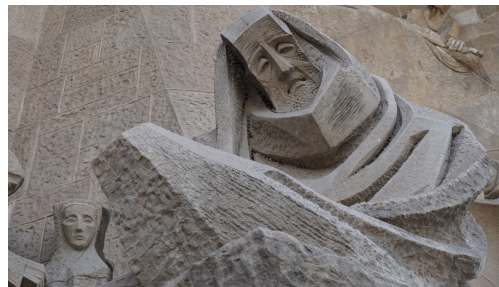
Peter After His Denial of Jesus