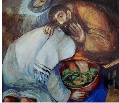
Jesus Washing Peter's Feet