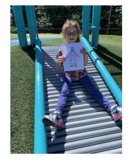
Flat Jesus at a park in Kent, WA (to the left)