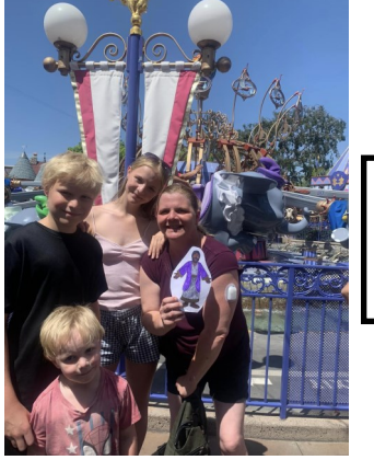
Flat Jesus at Disney Land! (to the left).