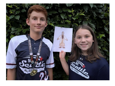
Flat Jesus out at some youth events.