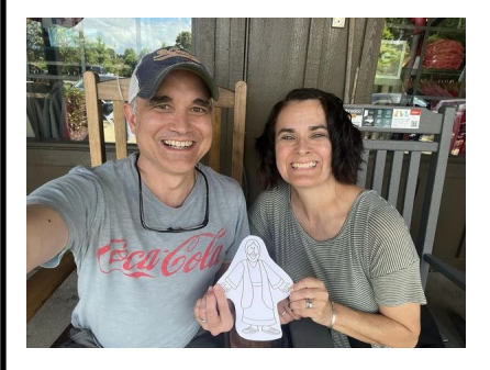
Flat Jesus on Lummi Island! (to the right).

Flat Jesus at a Cracker Barrel restaurant in the middle of Georgia. (to the right).