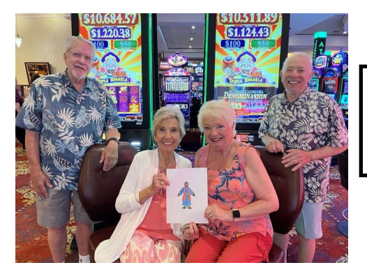
Flat Jesus in in Las Vegas!! (to the left).